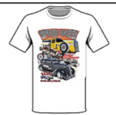
T-shirt, White $36 Mens - S to 5XL Ladies - 10 to 18

Speed Week merchandise will be available soon! Plus, all the regular club merchandise. Download the order form on the merchandise page www.dlra.org.au/merchandise.htm