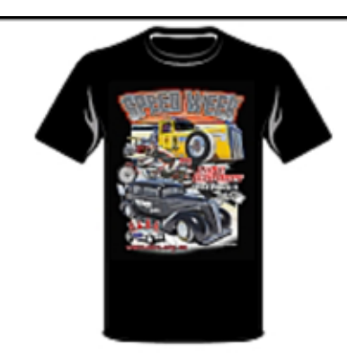
T-shirt, Black $36 Mens - S to 5XL Ladies - 10 to 18