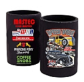
Stubbie Holders $12.00