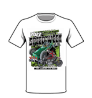
T-shirt, White $35.00: Mens - S to 5XL Ladies - 10 to 18 Kids - 10-12-14

For the first time ever these are being offered for sale. We have a small amount of previous years available too. Get them while they last!