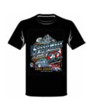
2020 T-shirt, Black or white $30.00