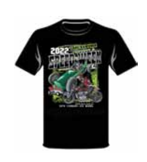
T-shirt, Black $35.00: Mens - S to 5XL Ladies - 10 to 18 Kids - 10-12-14